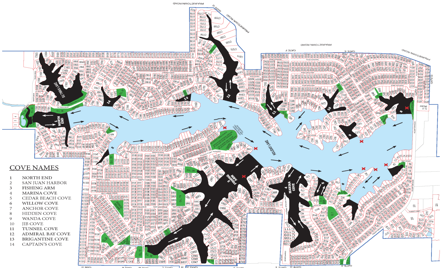
Fig. 2 Black Areas – No Wake

A wake is defined as the movement of water created by a boat underway great enough to disturb a boat at rest, but under no circumstances shall a boat underway exceed five (5) miles per hour while in a NO WAKE area. (625 ILCS 45/5-12)