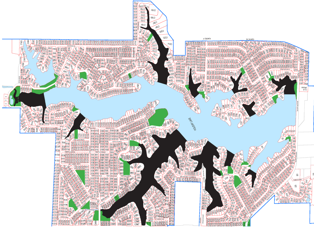
Fig. 2 Black Areas – No Wake

A wake is defined as the movement of water created by a boat underway great enough to disturb a boat at rest, but under no circumstances shall a boat underway exceed five (5) miles per hour while in a NO WAKE area. (625 ILCS 45/5-12)